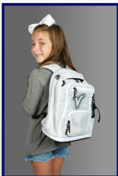
CheerVille Rebel Mini Dream Bag (optional)

Cheer Shoes: Athletes are required to wear an all-white cheer-styled shoe for each performance. Shoes can be purchased anywhere; a specific brand is not required. These can be found at local athletic wear department stores, or even on Amazon. We can also order a pair of Nfinity flights from the ProShop for $135. These are ordered directly through your ProShop or front desk.