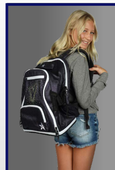
CheerVille Rebel Navy Dream Bag (optional)