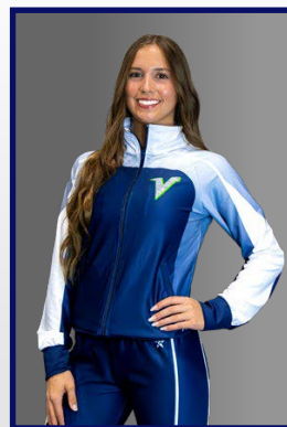
CheerVille Warm Up (optional)