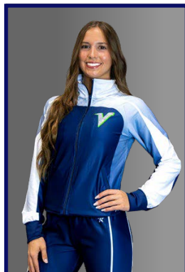
CheerVille Warm Up (optional)